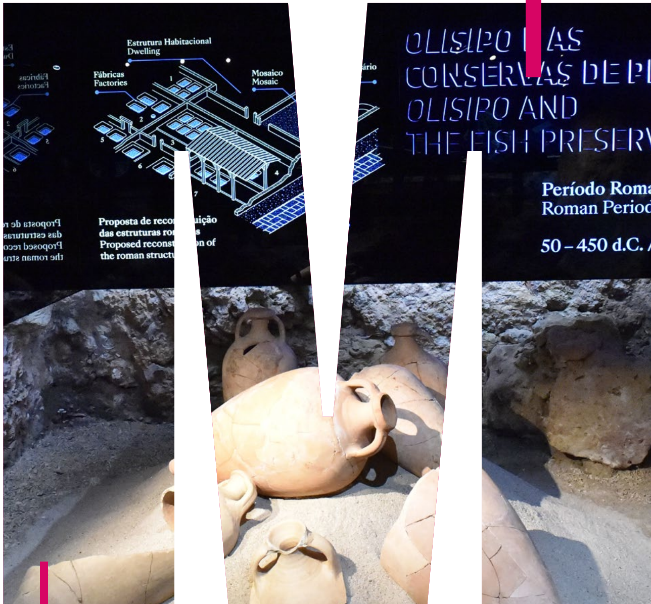
NARC: Garum's amphorae at the Roman Factory