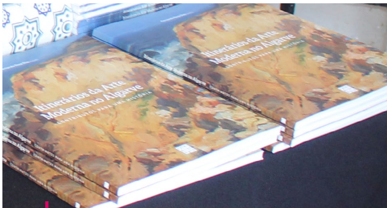
Exhibition “itineraries of painting/Modern Art”. Faro Municipal Museum

j) National Society of Fine Arts – loan of 19 works from several authors for the exhibit to honour the centenary of the birth of Francisco Pereira Coutinho.