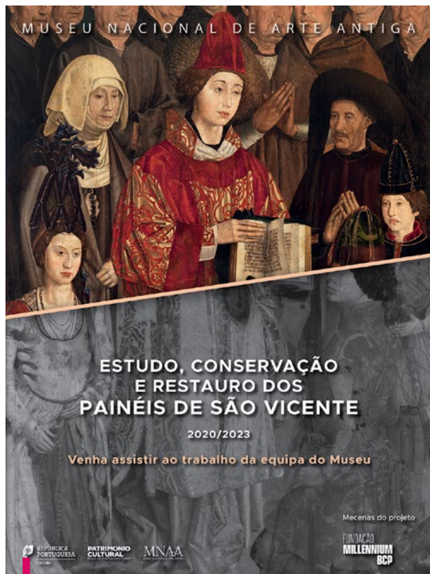
Conservation and restoration of the Painéis de São Vicente

at the end of the year. This initiative is part of the Bank's corporate social responsibility programme, developed in partnership with other areas of Millennium bcp.