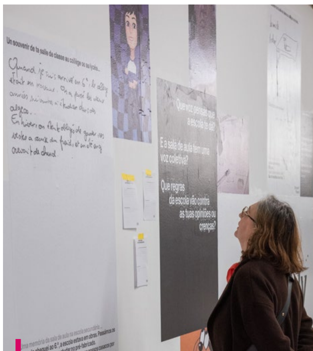
Lisbon Architecture Triennale - Garagem Sul, Centro Cultural de Belém