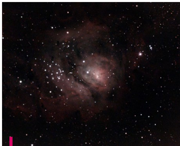
AstroCamp 2022 Academic Programme in astronomy and physics. Astronomy/Astrophysics Research Centre of the University of Porto