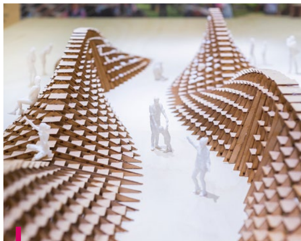
Exhibition “Multiplicidade” – National Museum of Contemporary Art

collectors, gallerists, artists and professionals from all over the world.