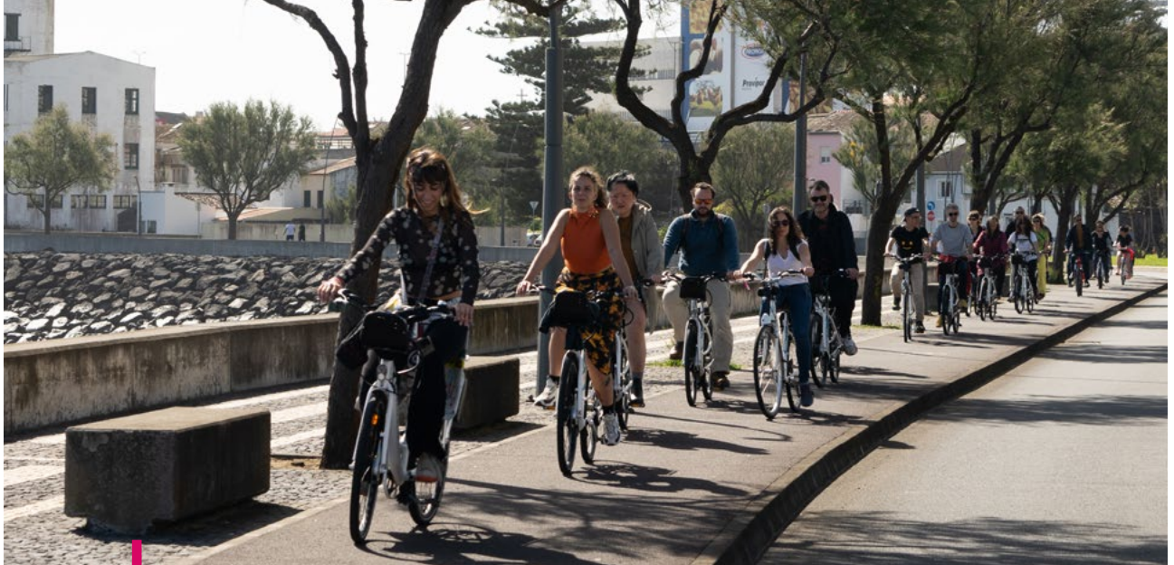
Tremor Todo-o-Terreno Initiative, within the 9th edition of the Tremor Festival. island of São Miguel, in the Azores

sole patron, with the initiative taking on the name Tremor Todo-o-Terreno Fundação Millennium bcp.