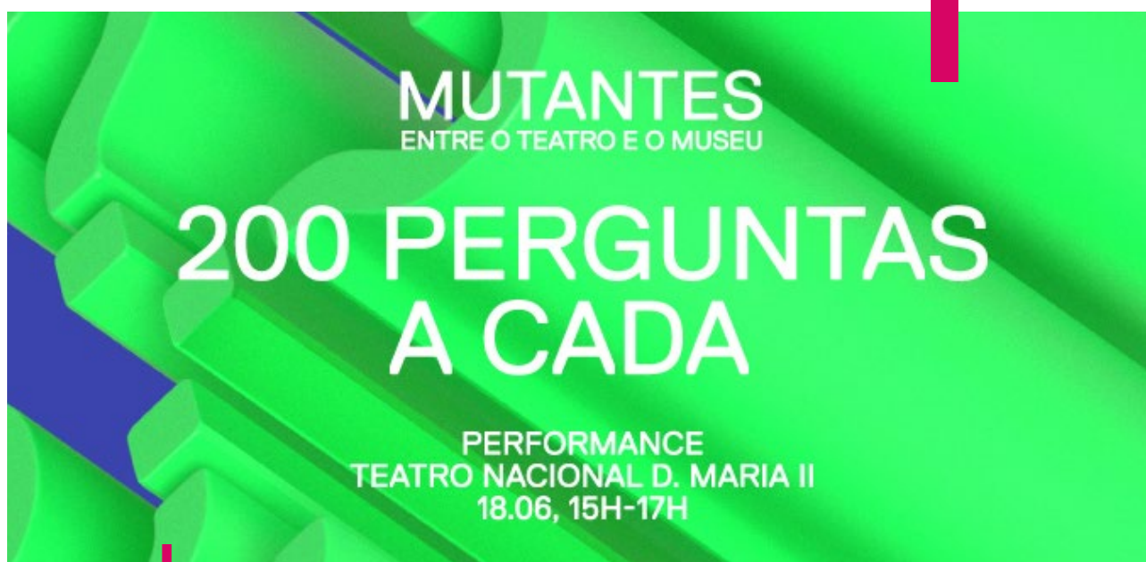
Mutantes Performance. As part of the BoCa programme