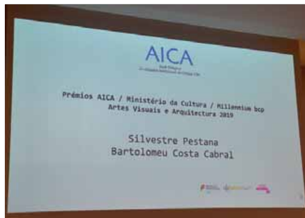
AICA/MC/Millennium awards of Visual Arts and Architecture.

memorable moments in an area where the cultural offer is quite scarce and the economic and social hardships are quite visible, thus helping to create the conditions to improve the quality of life in the eastern part of the city of Porto.