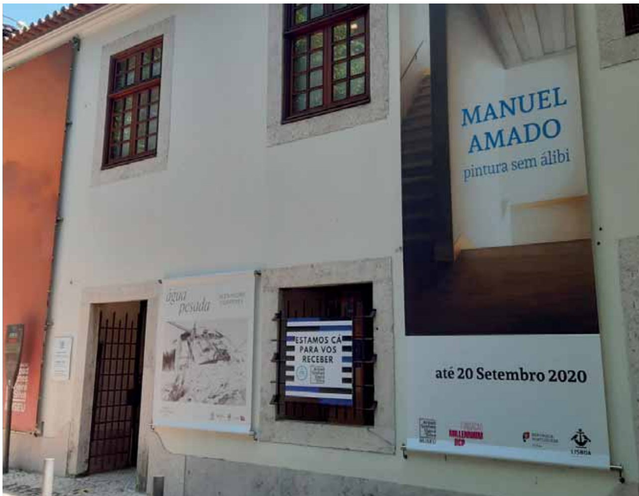
Exhibit "Manuel Amado – Pintura sem álibi", at Fundação Arpad-Szenes Vieira da Silva, in Lisbon.

The extension and depth of the impacts provoked by Covid-19, that led to a quite significant aggravation of the living conditions and isolation of the most fragile populations, gave rise to a special follow-up and support to the projects launched in order to mitigate the effects of this pandemic.