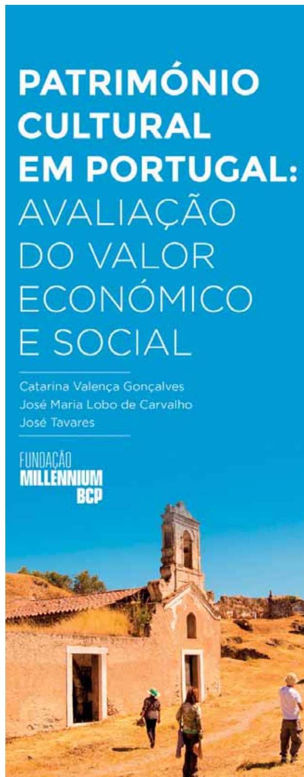
Research "Cultural Heritage in Portugal: Assessment of the Social and Economic Value".