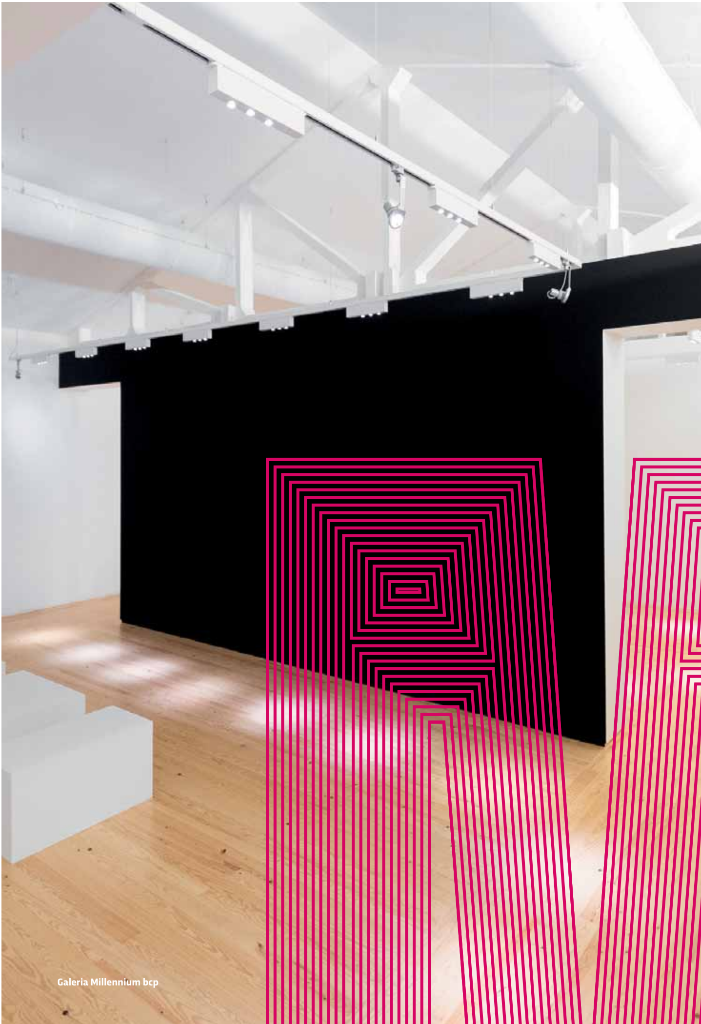
Galeria Millennium bcp