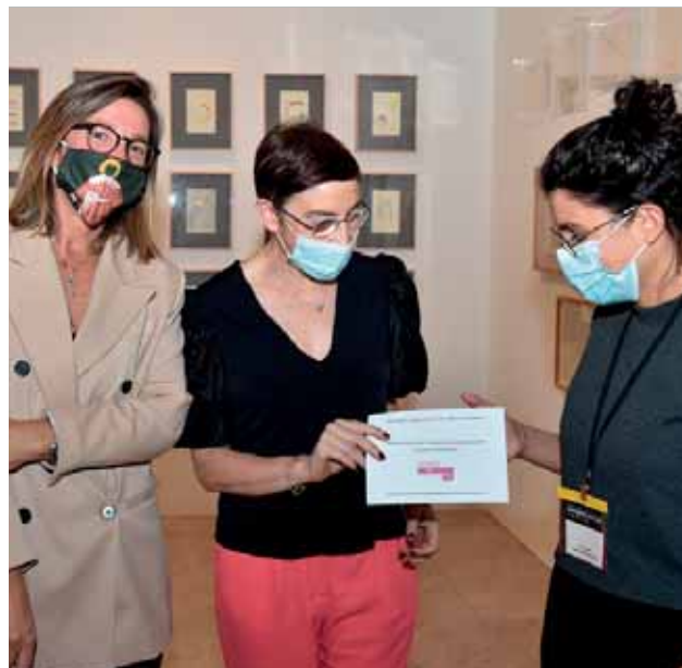
“Drawing Room Lisboa 2020”.