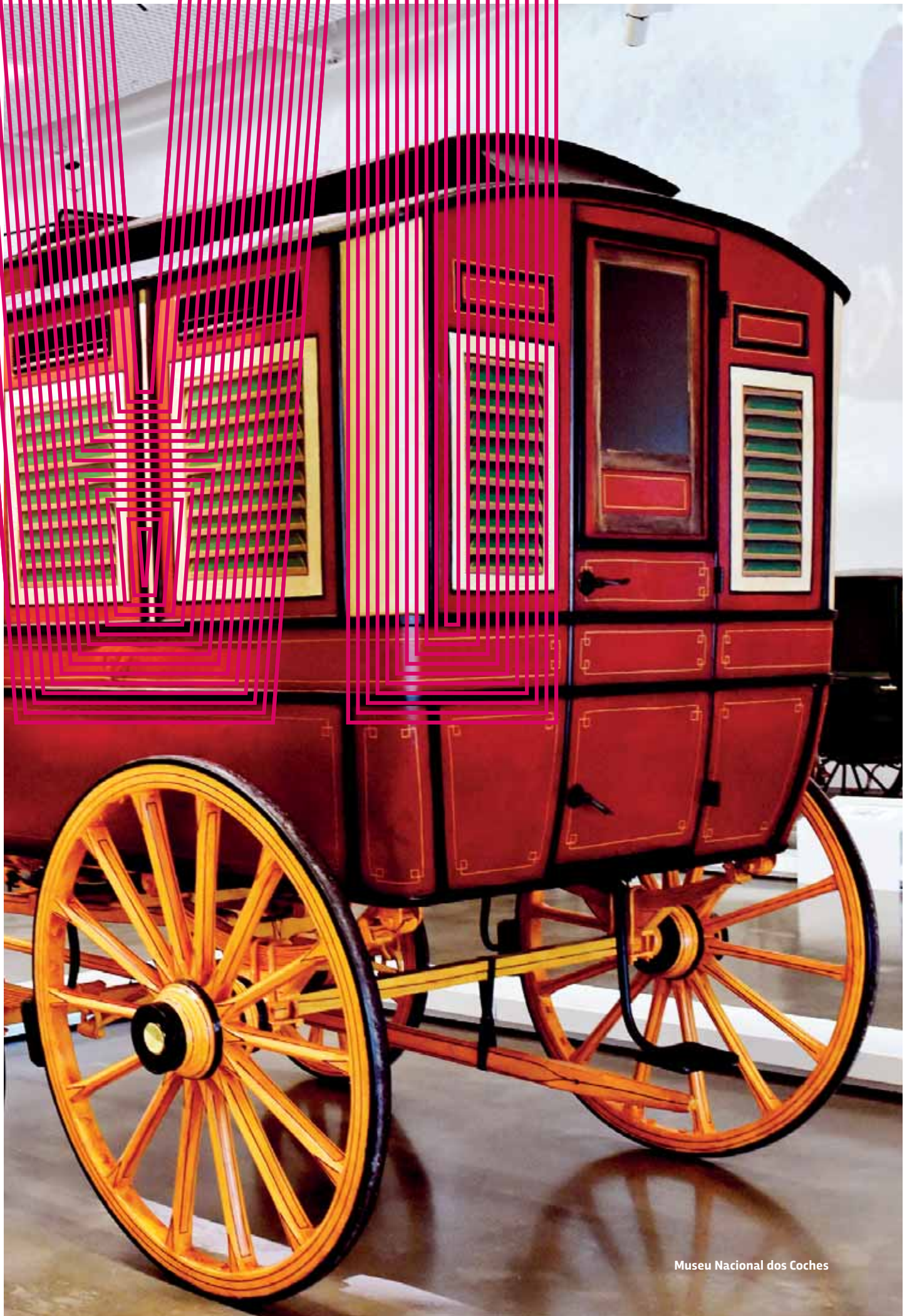
Museu Nacional dos Coches