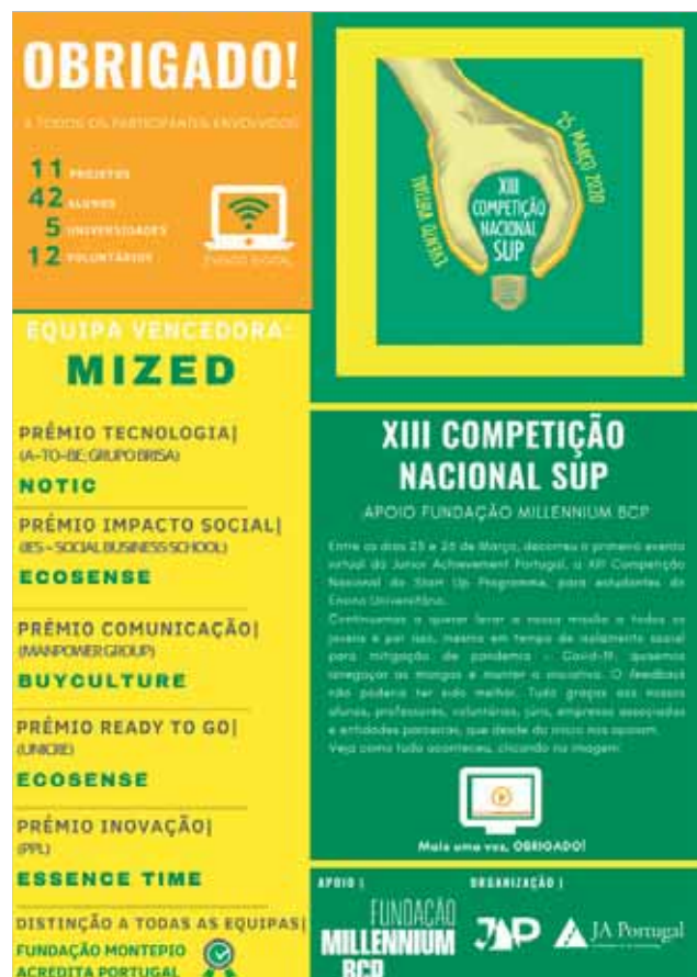
Junior Achievement: StartUp Programme (13 th edition).