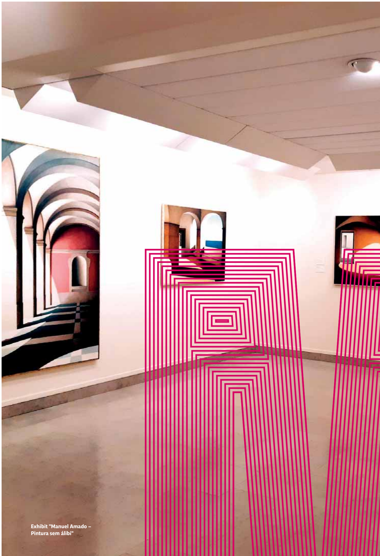
Exhibit "Manuel Amado – Pintura sem álbi"